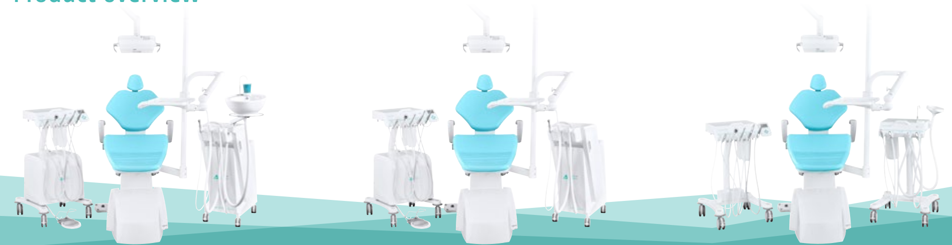
6 Self-contained Dental Unit P3 Master