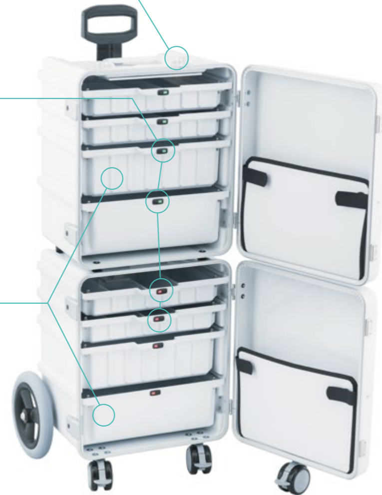
Portable dental equipment

4 drawers with freely selectable compartments