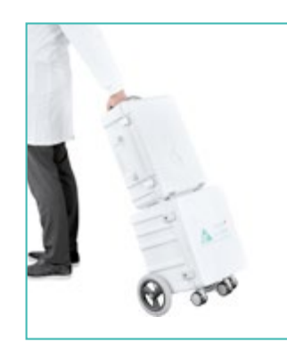
On a single trolley transport of unit/instruments/consumables