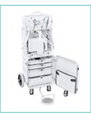
4 drawers for instruments/ consumables Separation red and green zone