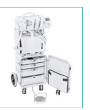
4 drawers for instruments/ consumables Separation red and green zone