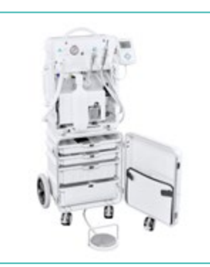
4 drawers for instruments/ consumables Separation red and green zone